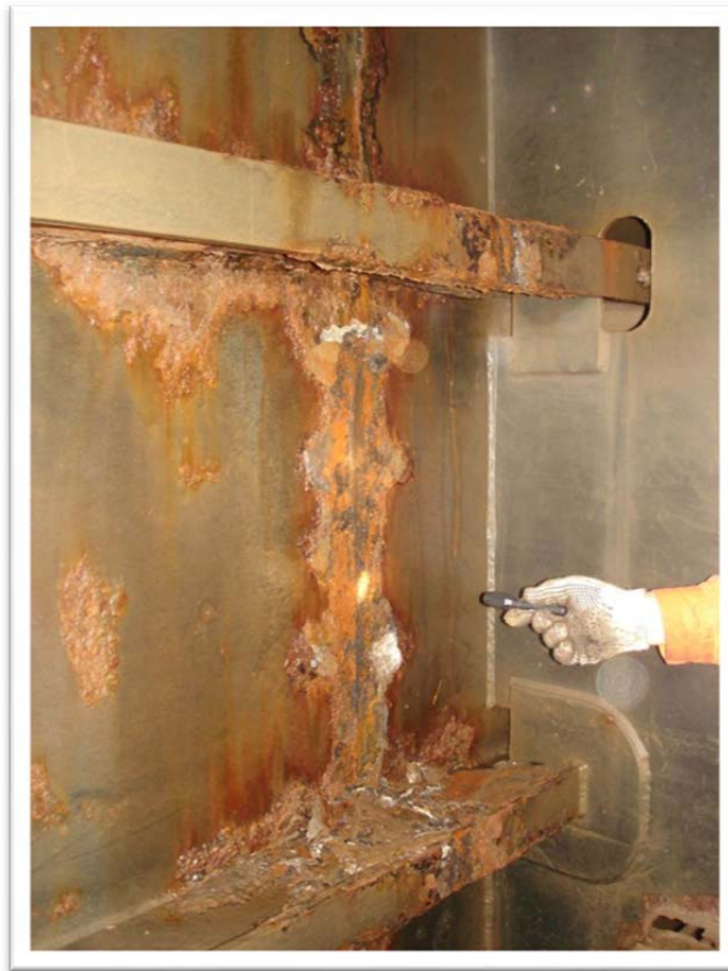
Figure 1 Example of power-tooled block joint after less than 10 years in service

The PSPC guidelines are intended for a 15 year coating life, but align with the TSCF guidelines for a 10 year coating life. However, ship owners have experienced many failures of coatings on power-tooled block joints even before 10 years service life.