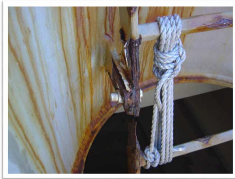
Figure 5 Insufficient coating on outfitting items leading to dangerous situation

means of access, non-integral outfitting items and specialized surfaces. It is considered useful if future revisions of PSPC incorporate the guidance provided in MSC Circular 1279.