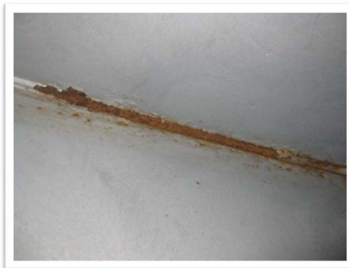
Figure 3 Inadequate stripe coating leading to breakdown

TSCF guidance specifies stripe coating to be carried out by brush only. Roller application for stripe coating is considered a lesser standard, with higher DFT and less penetration of substrate. IACS UI SC223 provides additional guidance on this aspect, stating that rollers should only be used for scallops, rat holes, etc.