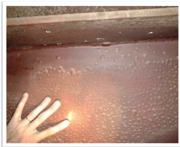
Figure 8 Example of paint blistering

Coating blisters are a localised separation of the paint from the surface and are often filled with fluid. The eventual breakdown of the blister will allow localised corrosion and further paint separation from the surface.