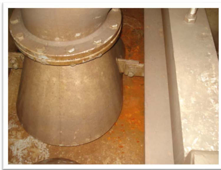
Figure 4 Example of corrosion under bellmouth

Ship owners have experienced higher rates of coating breakdown under bellmouths on tanks coated to PSPC guidelines. While it is possible to specify locally increased coating thickness to counteract this, it is not possible to specify any reinforced coatings because none have been approved through PSPC.