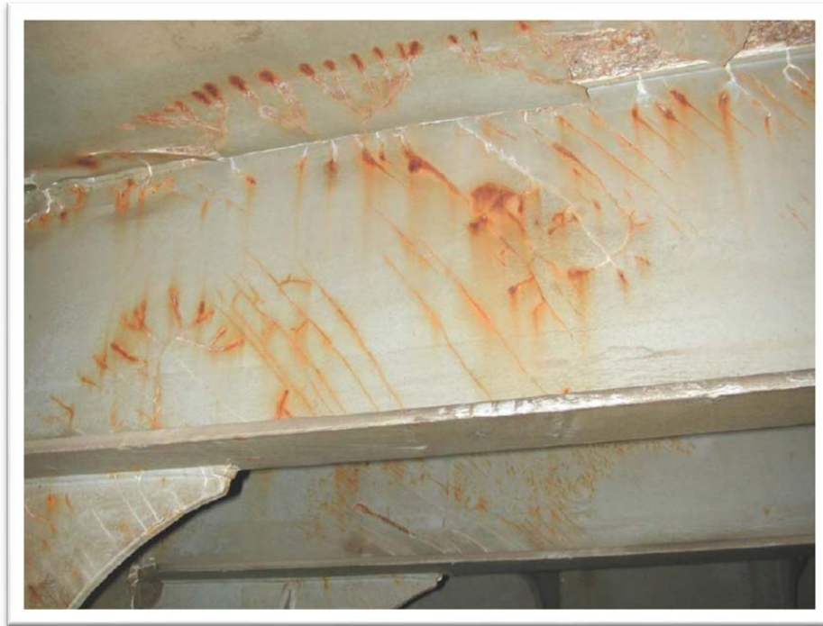
Figure 7 Paint failure in area of high strain due to insufficient flexibility

Recommendation: The laboratory testing procedure for the coatings must match the worst plausible in service application condition allowed by PSPC. This should include compression and tension bend tests, salt contamination, smooth surface profile and temperature cycles, as well as abrasion tests.