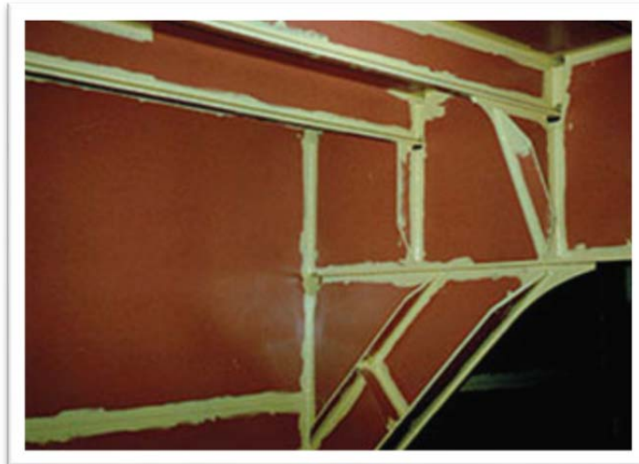
Figure 2 Example of good stripe coating